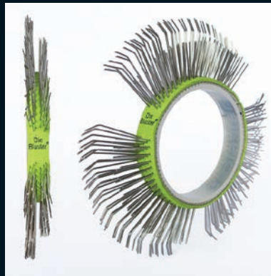
Die Blaster® Belt, Stainless Steel, 11 mm, Right