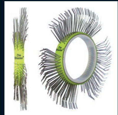
Die Blaster® Belt, Stainless Steel, 11 mm, Left