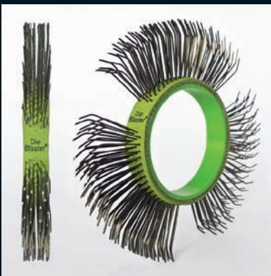
Die Blaster® Belt, Carbon Steel, 11 mm