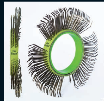
Die Blaster® Belt, Carbon Steel, 11 mm, Left