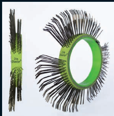
Die Blaster® Belt, Carbon Steel, 11 mm, Right